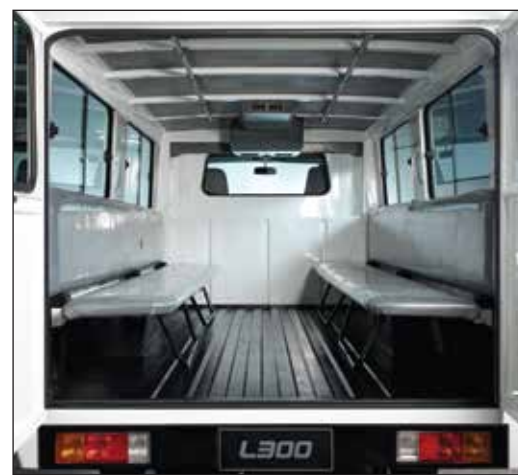
L300 Cab and Chassis shown with optional FB rear body and dual air conditioning system.

For many decades, no workhorse has been as reliable and versatile as the Mitsubishi L300. Built for the toughest jobs and road conditions, this utility vehicle is always ready to deliver.