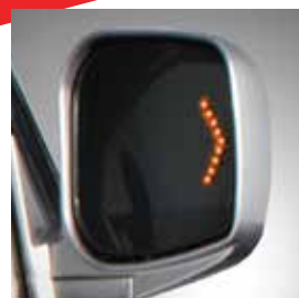
Side mirror with integrated LED turn signal lights (Dealer option)