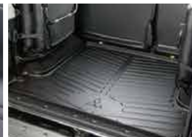
Luggage tray (Dealer option)