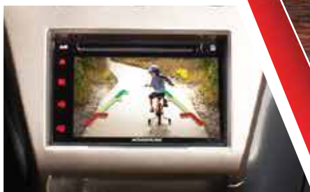
Reverse camera (Dealer option)