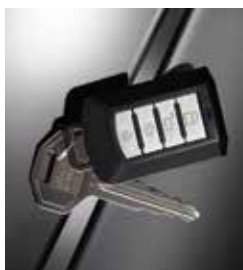
Security alarm with keyless entry (Dealer option)