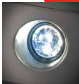
Fog lamps equipped with LED Daytime Running Lights (Dealer option)