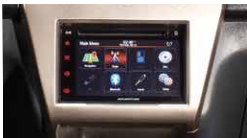
New 2-Din 6.8-inch LCD Touch screen with Tuner / DVD and MP3 player / iPod-ready / Micro SD and USB ports / Bluetooth connectivity