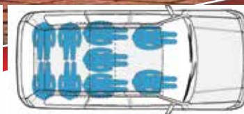
9-seater with side-facing rear seats (Dealer option)