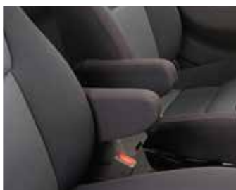
New front seat armrests (Dealer option)