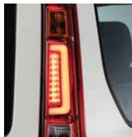
New LED tail lights