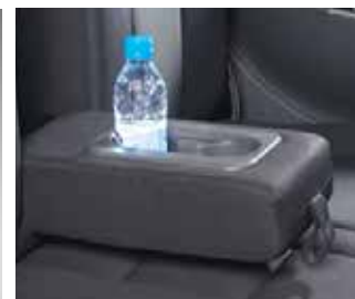
2nd row seats with center armrest and cup holders