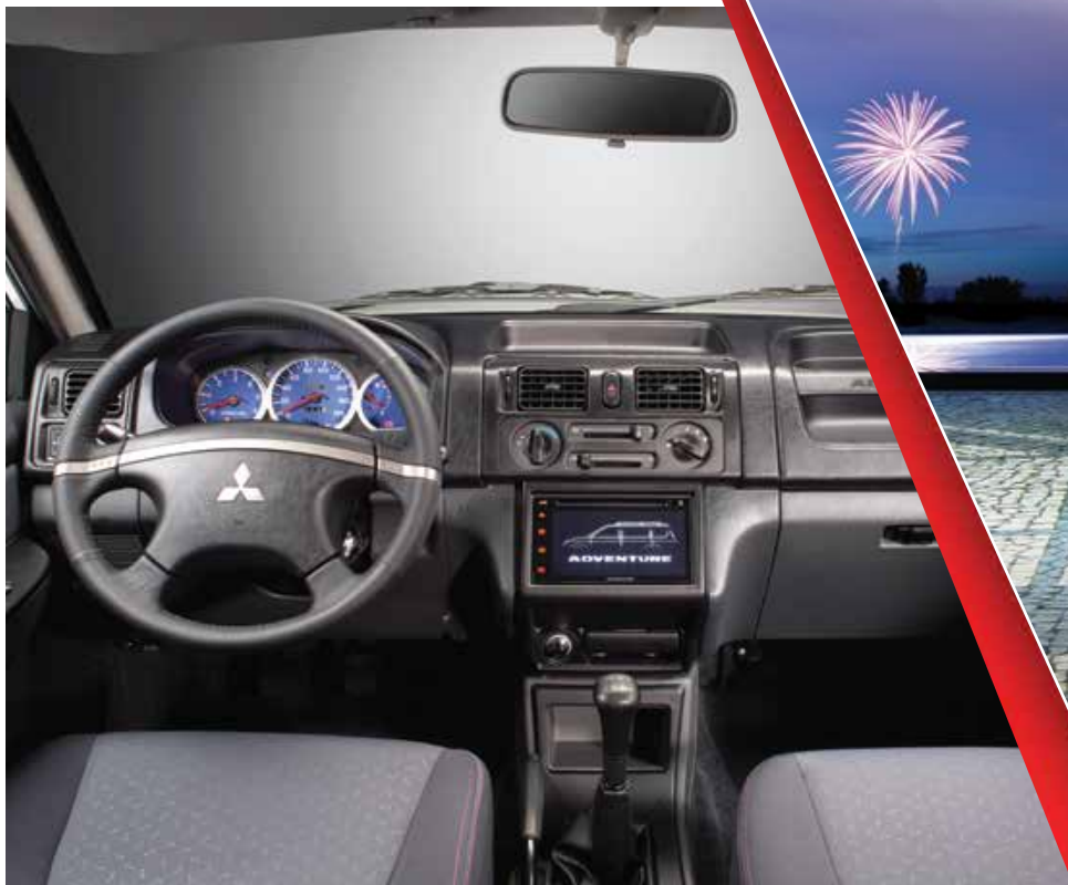
• White-lit meter cluster • 4-spoke leather-wrapped steering wheel