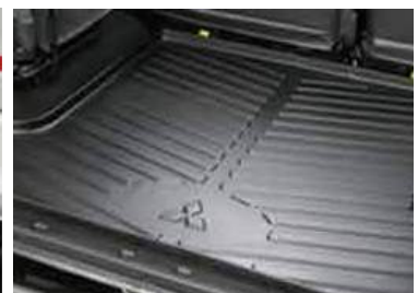
Luggage tray (Dealer option)