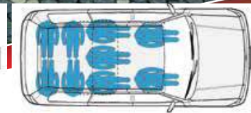
9-seater with side-facing rear seats (Dealer option)