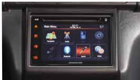
New 2-Din 6.8-inch LCD Touch screen with Tuner / DVD and MP3 player / iPod-ready / Micro SD and USB ports / Bluetooth connectivity