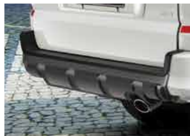
Black rear bumper skirt (Dealer option)