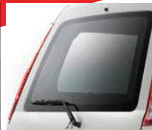
Rear wiper and washer