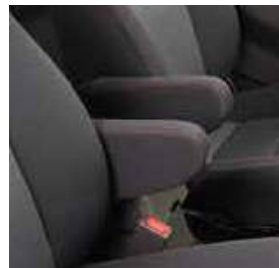
New front seat armrests (Dealer option)