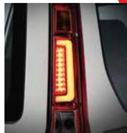
New LED tail lights