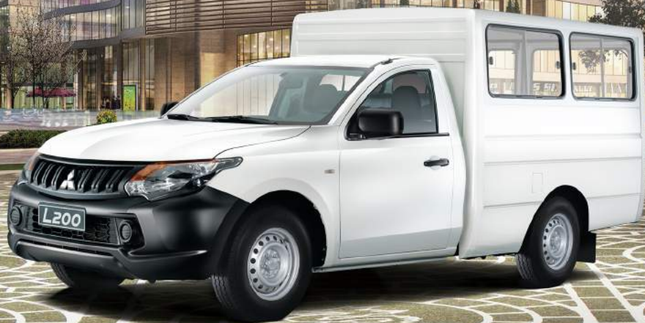
Photo shown: L200 cab and chassis fitted with FB optional rear body