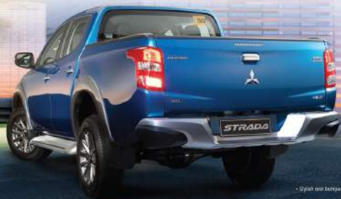
• Splash resistant bumper (GLS)