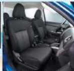
• Black High Grade Fabric Seats (GLS)