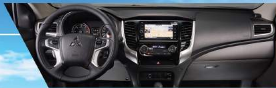
• Ashtray only (placing ash) at generic dashboard • New 4-spoke leather-wrapped steering wheel (GLS)