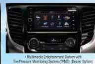
• Multimedia Entertainment System with Tire Pressure Monitoring System (TPMS) (Dealer Option)